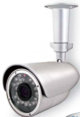
Digital WD 610TVL