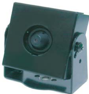
Pinhole Camera MTC-908HB MTC-906HB MTC-902HB