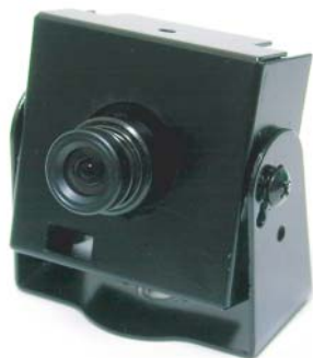
Board Camera MTC-908HB MTC-906HB MTC-902HB