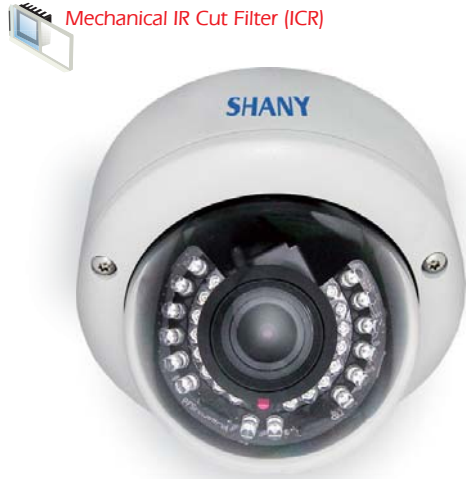
Mechanical IR Cut Filter (ICR)