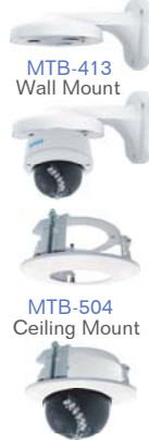
MTB-413 Wall Mount