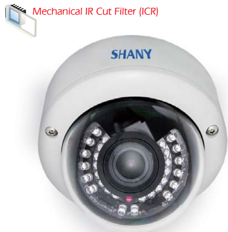
Mechanical IR Cut Filter (ICR)