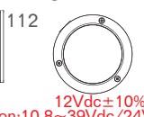
Option: Dual Voltage DC 12Vdc Input Video Output