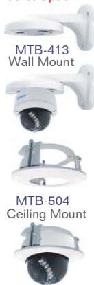
MTB-413 Wall Mount